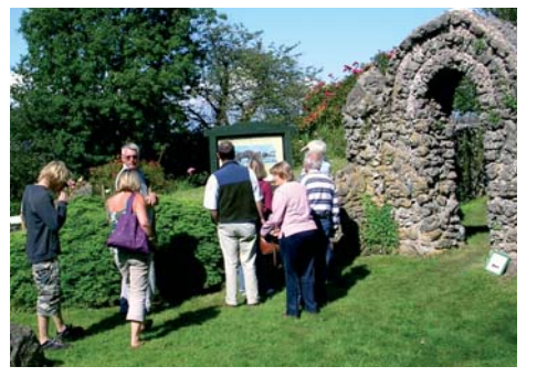
Visitors studying the notice board at the entrance to the Bone Cave

At the last open day on the 12th August nearly 300 visitors enjoyed an afternoon out at Banwell Caves. The weather was warm and sunny and the visitors enjoyed their cream teas on the terrace in between a tour of the Bone Cave, climb to the top of Banwell Tower and watching a film of the history of The Caves.